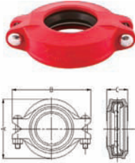
Reducing Flexible Coupling